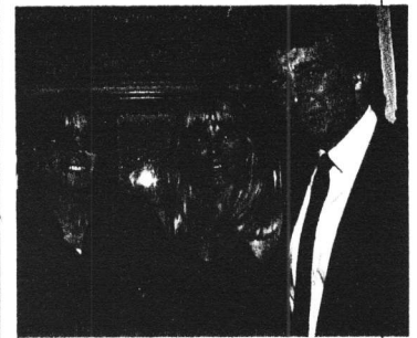
MICHAEL JACKSON, MARLA MAPLES, AND DONALD TRUMP