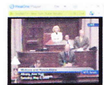
WATCH THE SENATE LIVE